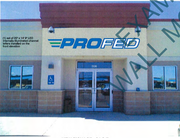
NEW SIGNAGE - 24 S.F.