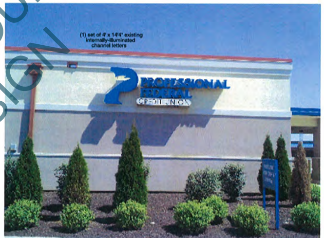
EXISTING SIGNAGE - 56 S.F.