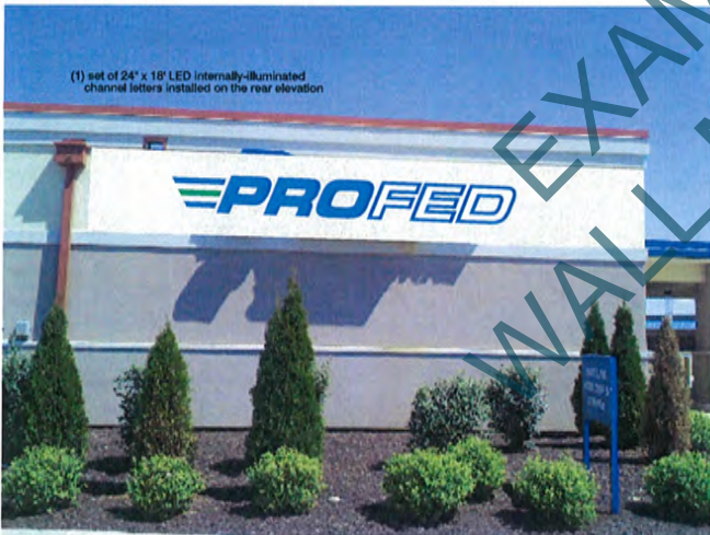
NEW SIGNAGE - 36 S.F.